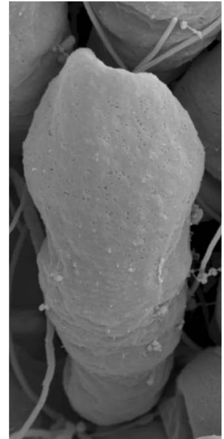
SEM of cultivation experiments with and without symbiont